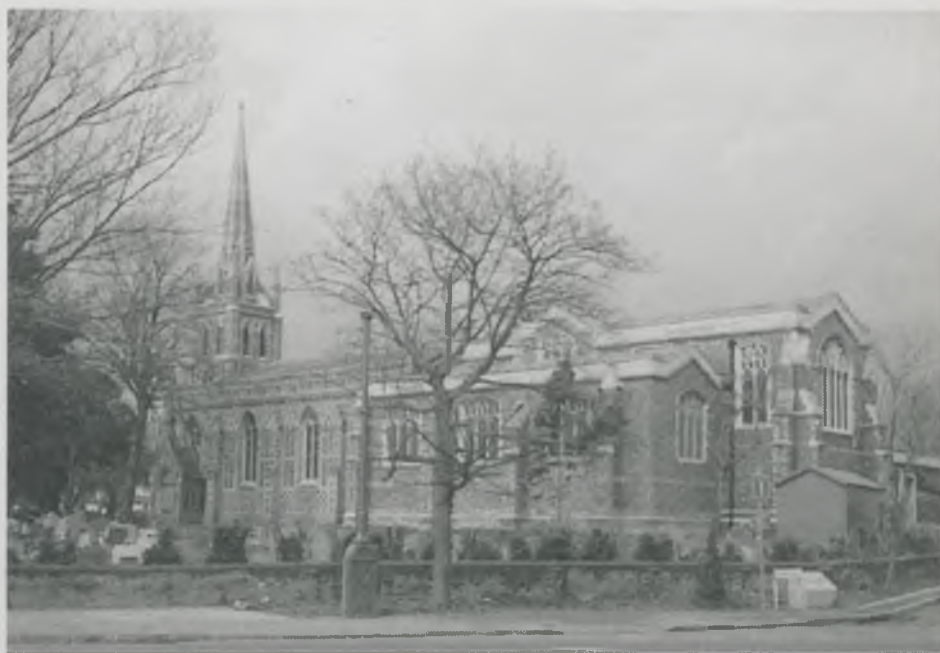
Chingford Parish Church. SS Peter and Paul (the new church)

22 Duke Street, Burton Latimer Kettering, Northants NN15 5SG