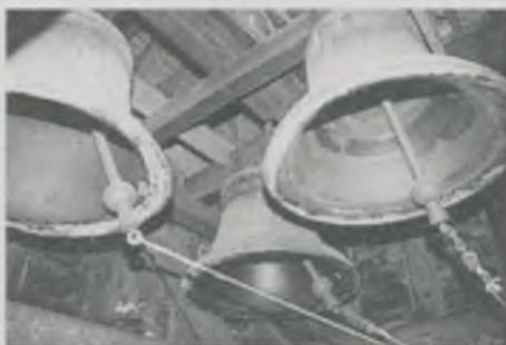
Chingford Old Church bells

Thumb for having "layde in gage of the church plate one chalyce and one cross of silver 'p'cell gylte for making a new roof and repaying the same Churche." This 'gage' has never been redeemed, so if this plate is anywhere in private hands it is hoped that it may be restored to the Church to which it belongs.