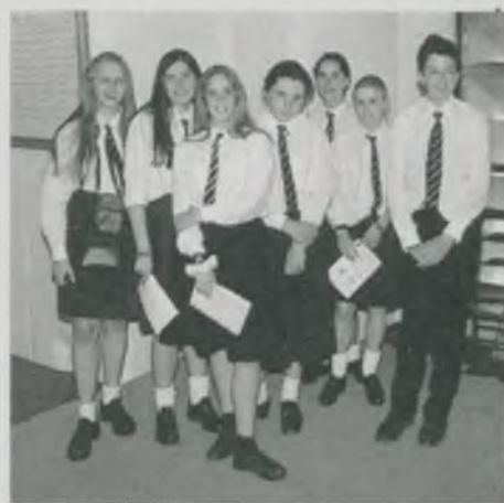
In Westminster Abbey ringing chamber

The total cost of the project has been in excess of £30,000.