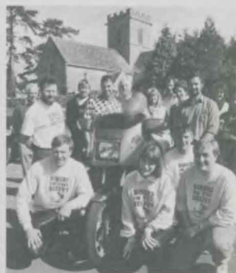
Bikers gathered outside church.