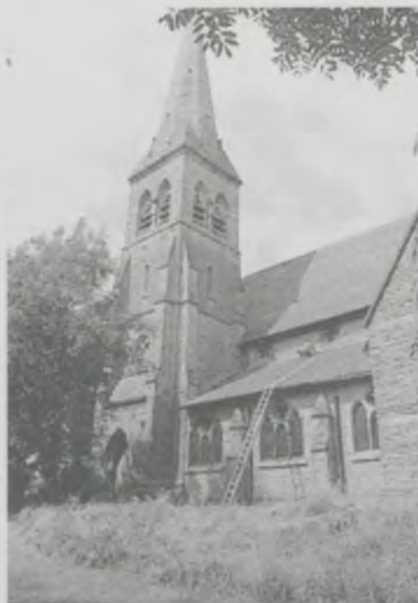
All Saints, Hamer