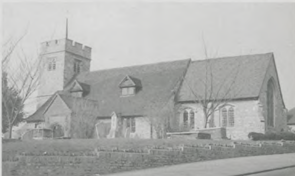
Chingford Old Church. All Saints