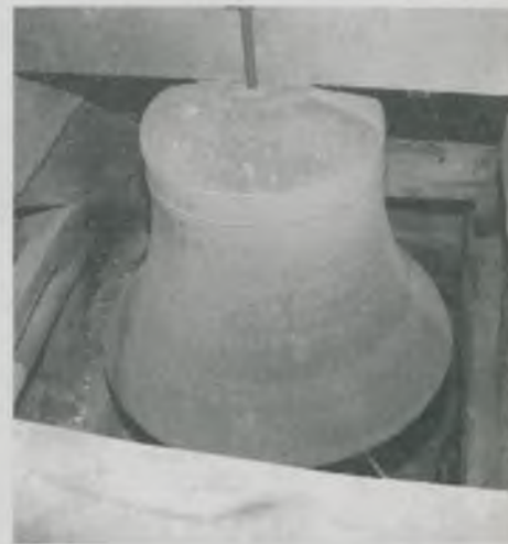
Chingford Parish Church – the tenor