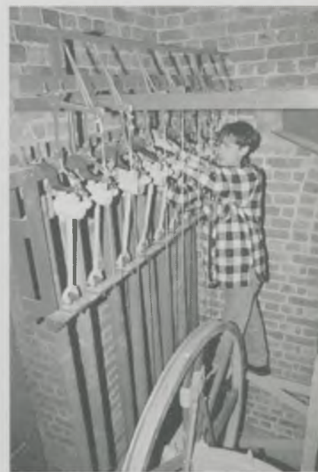
The restored tubular bells

By Mid June we were ready to assemble the frame and test the bells in it. As the frame was in two tiers it had not been possible to assemble it in the workshop, so everything had to be moved