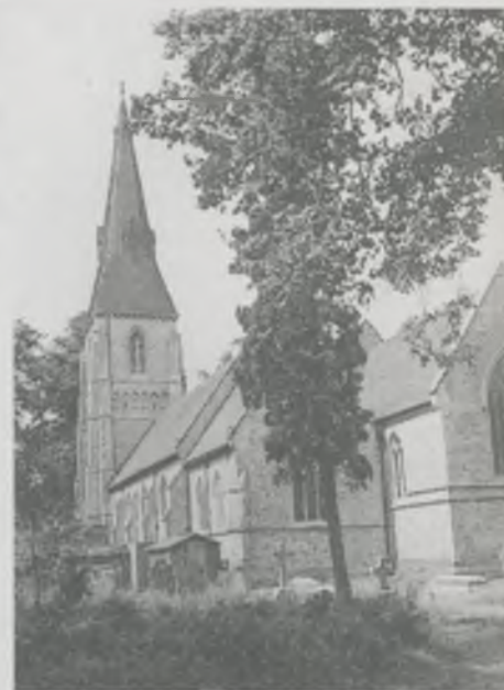
St Mary's, Caterham

Work also started at this stage to remove the existing tubular bells (the largest weighs approx two hundredweight) and prepare the holes for the end of the main girders. Many of the ringers in the area will well remember the Saturday when we poured the many hundreds of buckets of concrete to form the bearing pads. The work went on until the early hours of Sunday morning. Whilst this was being undertaken a bat decided to visit the ringing room.