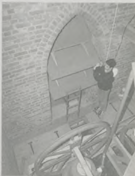
Completion of the louvre project

The Surrey Association decided to use the Oatway legacy, now £8600 with interest, for the Caterham Scheme. This had originally been offered to St Margaret Chipstead but that scheme was unlikely to go ahead for the time being. The legacy was used to purchase the bells from the rescue fund and donate them to St