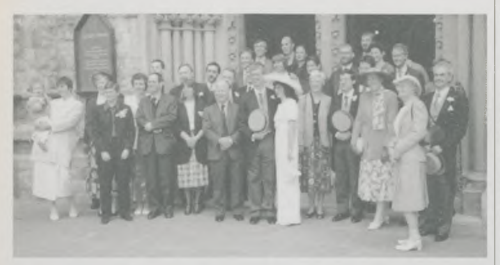
The wedding party at Kensington.