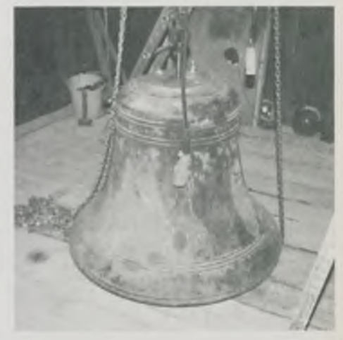
The Buckland Dinham tenor

The oldest bell in the tower, now the 7th, was cast in Bristol in 1520, probably by Thomas Gefferies. The present 4th was cast by John Lott of Warminster in 1638 and may have been a new bell added to a former ring of four bells. Early records indicate that five bells were rung from the floor of the tower in 1756. This is confirmed by the churchwardens' accounts for 1819 which detail the rehanging of five bells in an oak frame