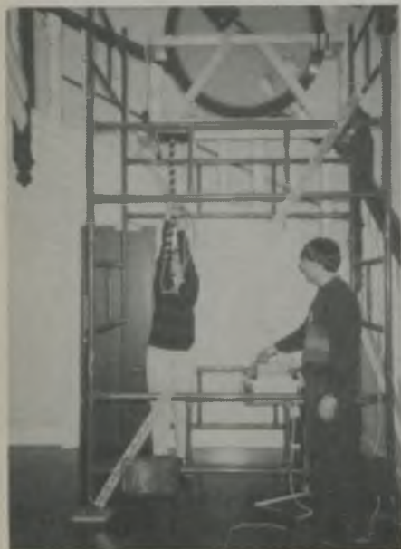
The Bagley simulator in action.