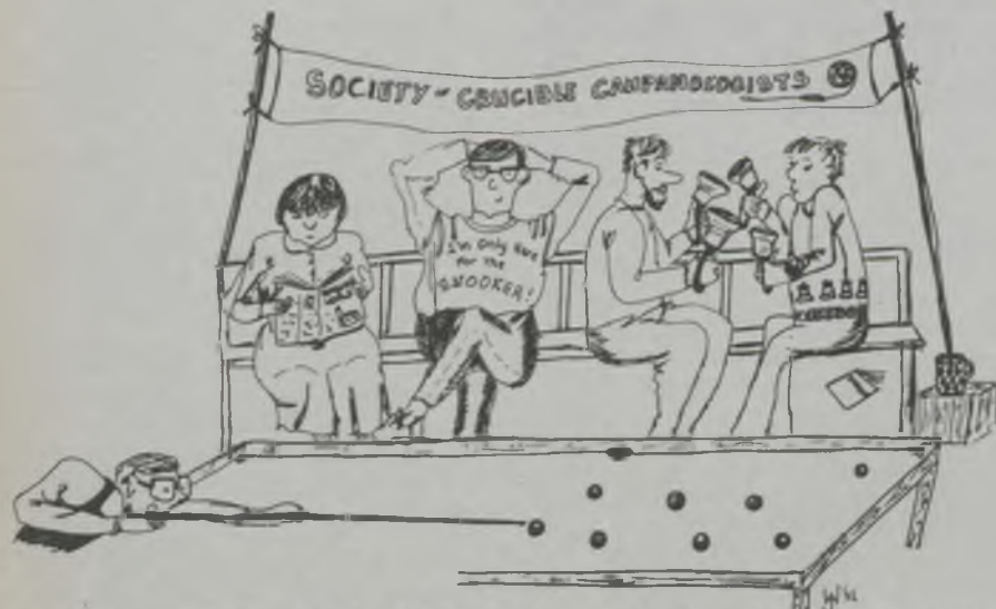
... and now we go over to the Crucible for live coverage of the International Snooker Audience Participation Championships.