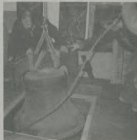
The old tenor on its way out.

It must be said, however, that the old tenor still had some influence, and it took three attempts before the first peal on the new tenor was successful. It was more than a month later before a peal of Cambridge Major was rung on the back eight by a Furness Branch band.