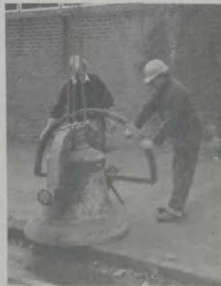
Removal of the Beswick bell.

Oh, glorious are the guarded heights Where guardian souls abide - Self-exiled from our gross delights - Above, beyond, outside: An ampler arc their spirit swings - Commands a juster view - We have their word for all these things. No doubt their words are true . . . RUDYARD KIPLING.