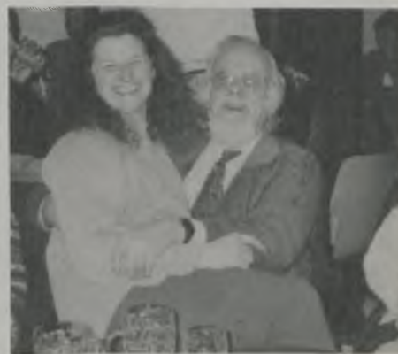
Mr. Speed - quick off the mark!