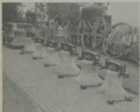
The bells pictured after the re-hallowing service.

Hopefully, before too many years have passed, our eight bell frame will hold the two extra trebles for which it was made, and Triples and Major methods will be heard over the Whittington countryside but that, as they say, will be another story - the final £6,000 has still to be raised by sheer hard work.