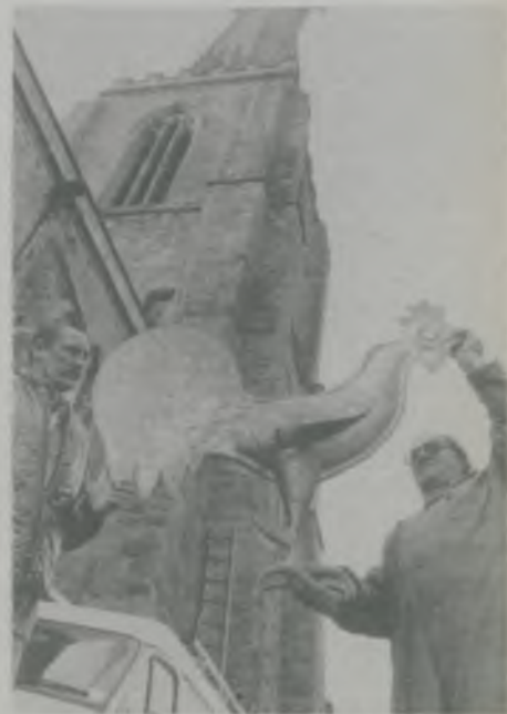
The weather cock at All Saints, Hereford.

In the middle of July 1645 the city came under siege by an army of Scots under Lord Leven, but it was relieved by King Charles at the beginning of September: the accounts show that there was payment for “Ringing for the King”, probably on this occasion. (Charles had been in Hereford during the second half of June 1645 after the Royalist defeat at the battle of Naseby, but it seems unlikely that his visit would have been celebrated under those circumstances). However, there was little respite for the city after its relief from the Scots, and it was taken by the Parliamentarians in December 1645 using a ruse de guerre , who strongly garrisoned it until the end of hostilities. No doubt life was disrupted –