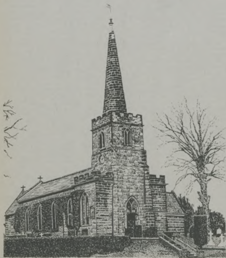
St. Giles, Whittington, Staffs.

Loyal support has been given by a number of Society members in training the Whittington ringers and each week advances are made by each member of the band, which is in itself ample reward for the efforts put in by the regular helpers.