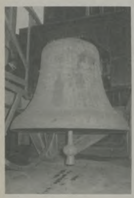
"Great George" of the University of Bristol.