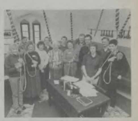
One of the instruction courses in Mere belfry.