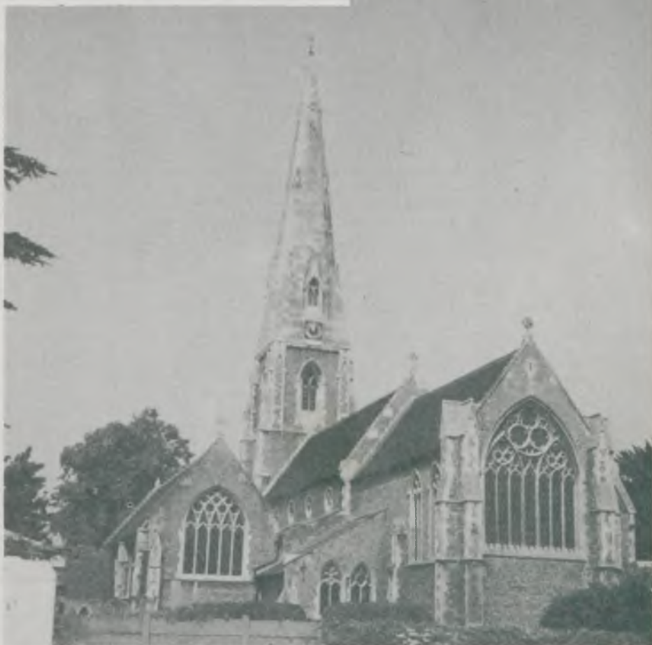
St. James, Weybridge, Surrey

The removal of the remaining timbers and the chiselling out of the foundation cavities for the new frame was a tedious and grim business since the infill between the interior and exterior brickwork of the spire consisted of large lumps of granite and flint. During this period the ringers were joined by several members of the congregation, the resulting friendships and team spirit engendered in adversity were an important bonus which sustained us throughout the remainder of the rehang.