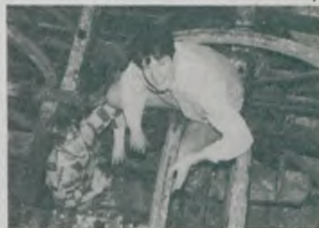
Dismantling the old frame