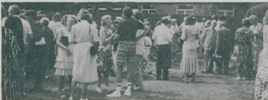
A day of celebration as the bells ring out