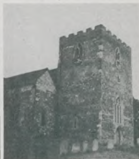
St Mary's Oxted, Surrey