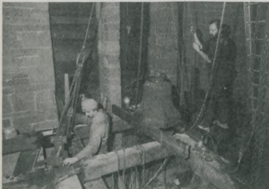
Rehanging the bells of St. Laurence, Ludlow

CONTENTS: 120 Fate of the London bells • 122 Blackburn's 100 • 123-4 Obituaries 125 Peals (1989) • 131-40 Index for 1988 • 141 Peals (1988) • 147-8 Code of Practice proposal