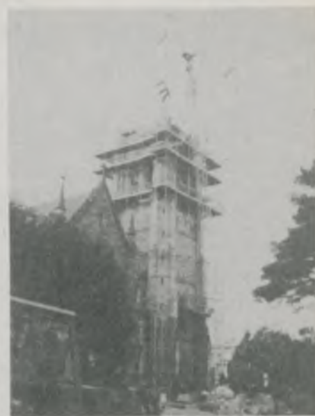
Frame side being lowered into St. Saviour's Cathedral, Goulburn, N.S.W., Australia

Somewhat unusually there have been only two recastings of cracked bells from within rings of bells. The first one is for Oxford, St. Mary Magdalene , where the tenor bell has