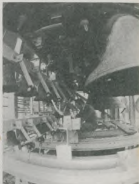
Installation work in progress on the Bournville Carillon

The last year has seen some seven recast, refurbished or augmented rings of bells going to various churches in the old county of Yorkshire. The first scheme was the final phase of the work at St. Wilfrid's Church, Burnsall . It was mentioned in the article of May 1987 that the six bells were languishing in our works