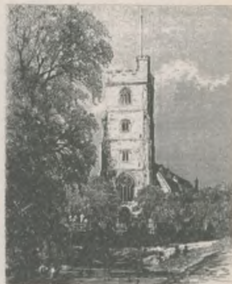
ALL SAINTS, FULHAM.