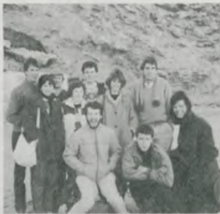
"The Society on Marsden beach"