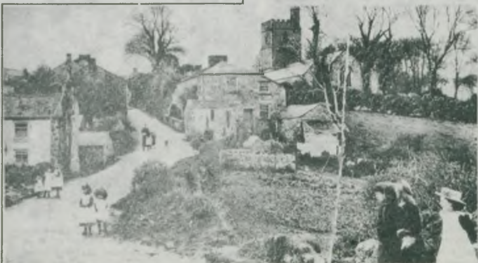
Luxulyan Village and Church about 1902.