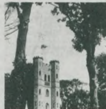
The Waterloo Tower, Quex Park, Birchington: "The only secular ring in the County". (See also pp.445 and 463)

If you have any specific enquiries, contact our information desk in the Central Council Sitting room at the Headquarters Hotel or give me a ring on Minster (0795) 872579.