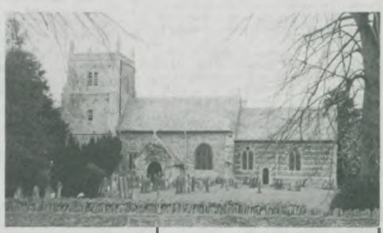
ST. MARY, DUNS TEW 5 bells (14 cwt)