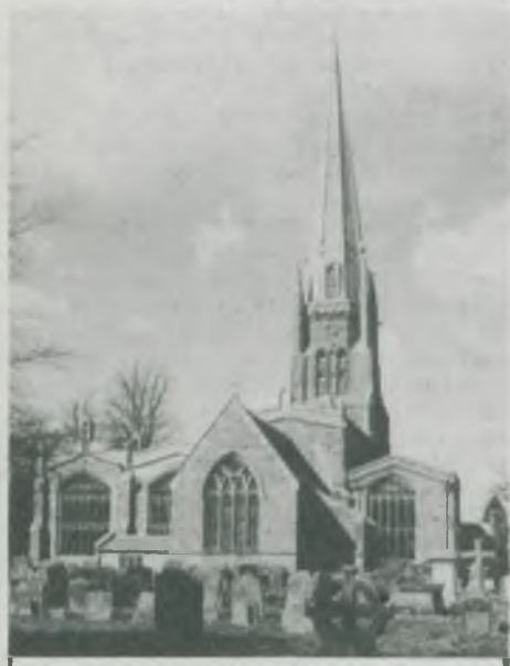
OUR LADY OF BLOXHAM, BLOXHAM. 8 bells (26 cwt)