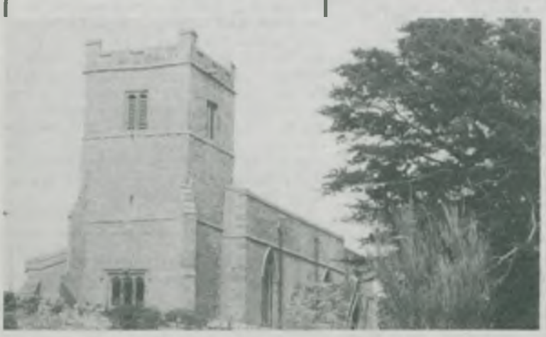
ST. MARY, ADDERBURY 8 bells (24 cwt)