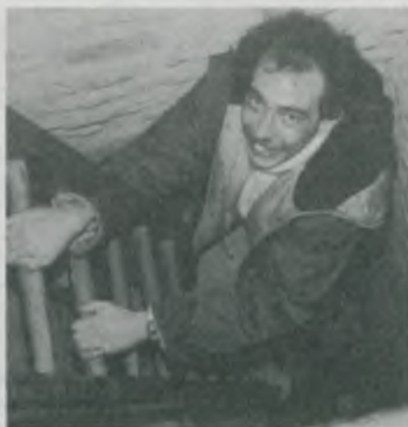
Welsh Colleges Society