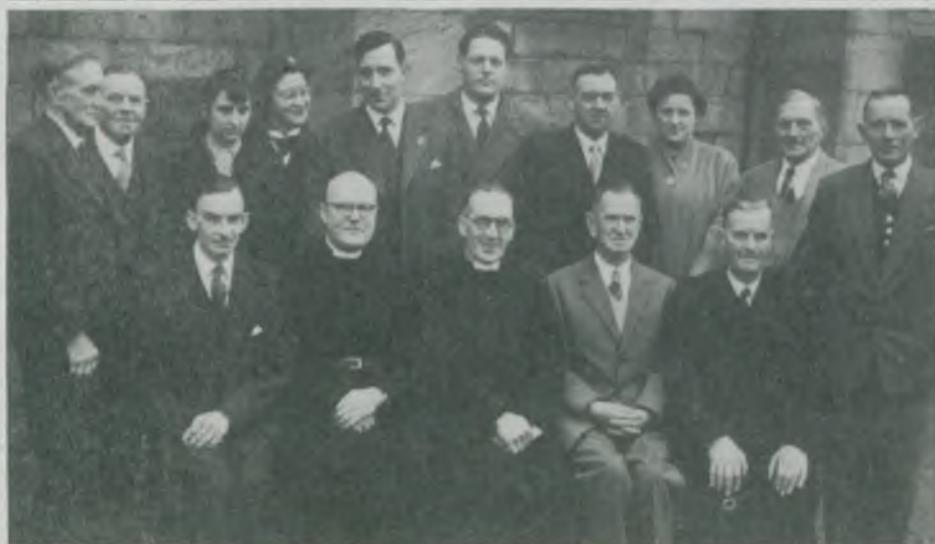
Ringers at the rededication.

We lose because we win. Gamblers, Recollecting which, Toss their dice again . . .