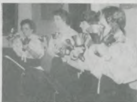
The Cookham Handbell Ringers entertaining the company after the formal proceedings had been completed.