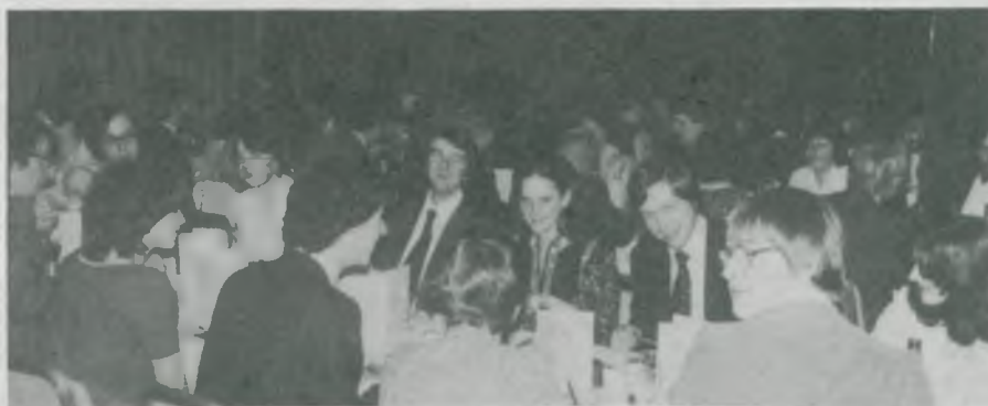
Ringers from Selly Oak and Harborne on table in front of picture.