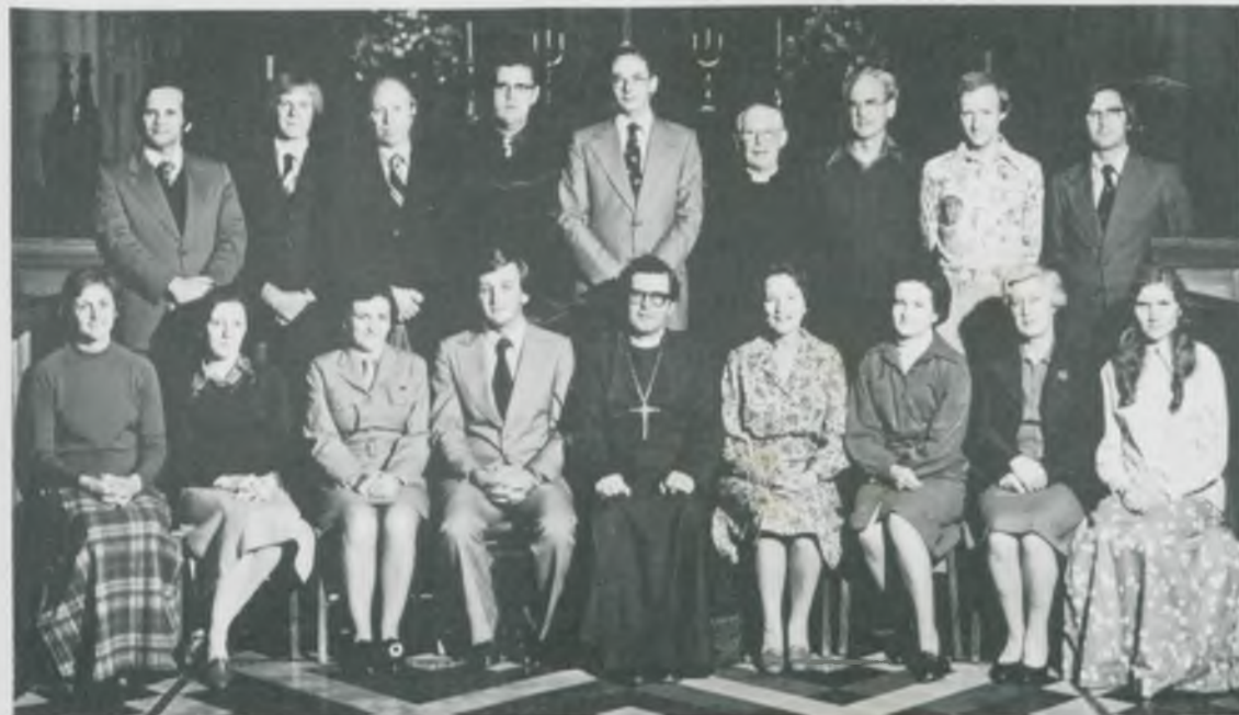
The Ringers of Adelaide Cathedral (see overleaf)