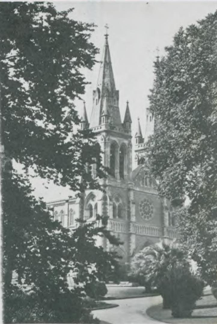
ST. PETER'S CATHEDRAL ADELAIDE, S.A.

Copies of this Jubilee Edition may be obtained from Ringing World, Penmark House, Guildford GU1 1BL 25p inclusive