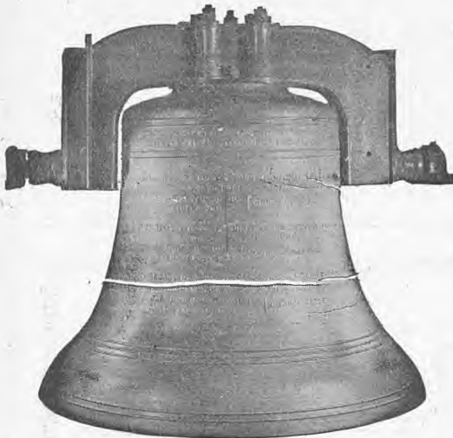
SHERBORNE ABBEY RECAST TENOR.