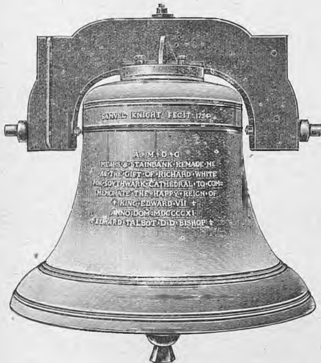
THE TENOR BELL, SOUTHWARK CATHEDRAL, Weight, 50 cwt. 0 qr. 21 lbs.

This bell was recast, and the peal of twelve rehung by us in September last. Since then the following peals have been rung on the bells:—